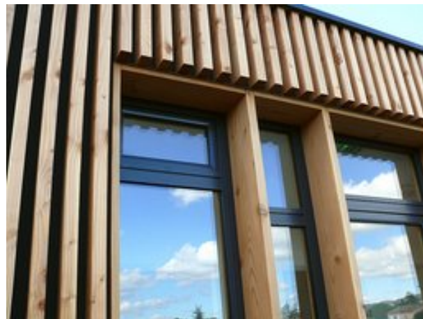
BARDAGE CLAIRE VOIE